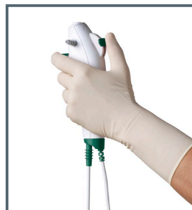
The ergonomic and lightweight handle is designed to give you a firm and comfortable grip