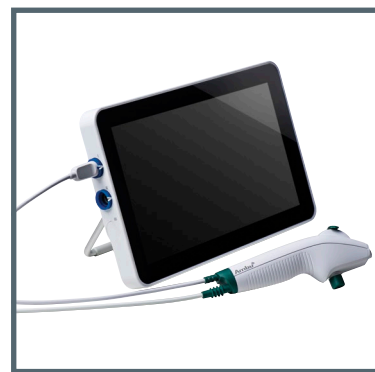
Ambu aScope 4 Broncho Regular and Ambu aView 2 Advance