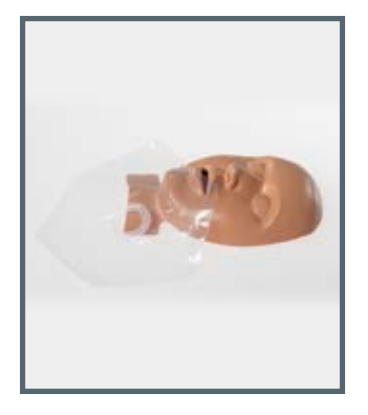
Ambu hygienic system