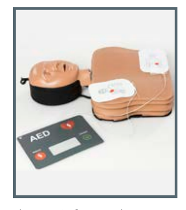
Placement of AED pads