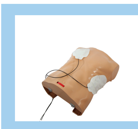
Placement of AED pads