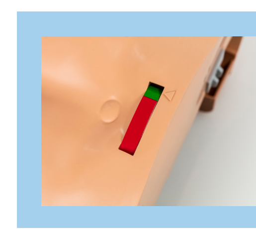
Compression depth indicator