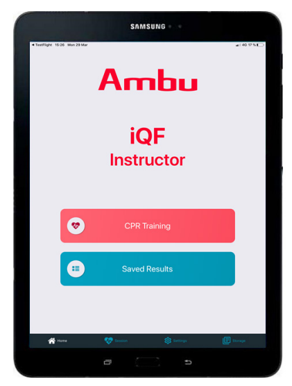
Ambu iQF Instructor

Help your students perform perfect compression depth while enjoying games and competing with each other.