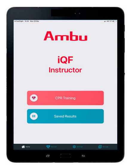
Ambu iQF Instructor

Help your students learn to perform a perfect cpr in a fun way with the option of games and competitions.