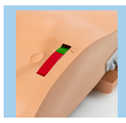
Compression depth indicator