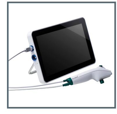
Ambu aScope 4 Broncho Regular and Ambu aView 2 Advance