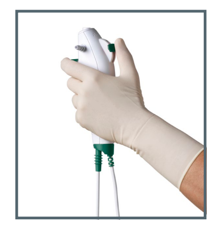
The ergonomic and lightweight handle is designed to give you a firm and comfortable grip