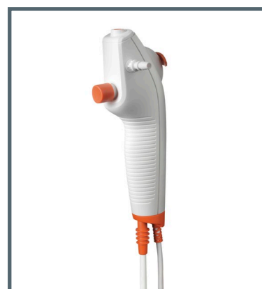
The ergonomic and lightweight handle is designed to give you a firm and comfortable grip