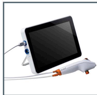
Ambu aScope 4 Broncho Large and Ambu aView 2 Advance